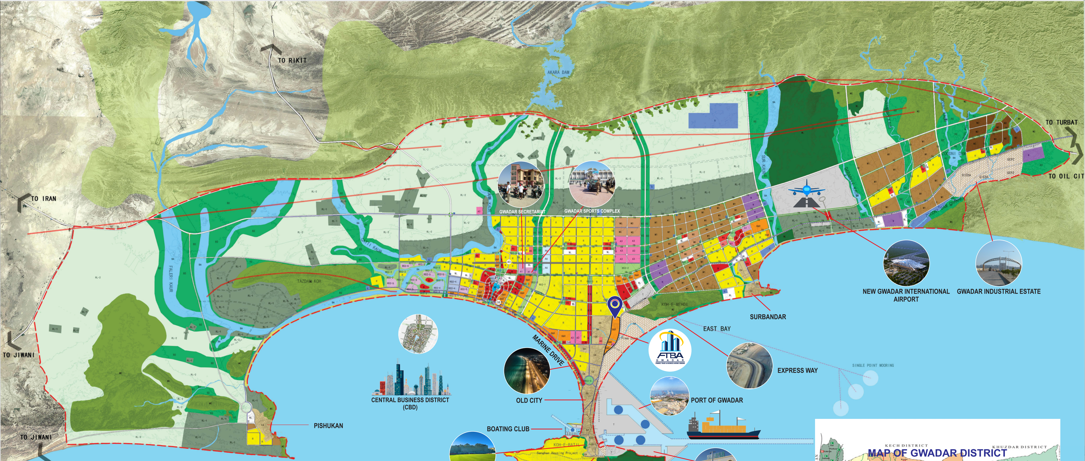
Gwadar smart port city master plan (2020-2050) Actual map from the Gwadar Master Plan